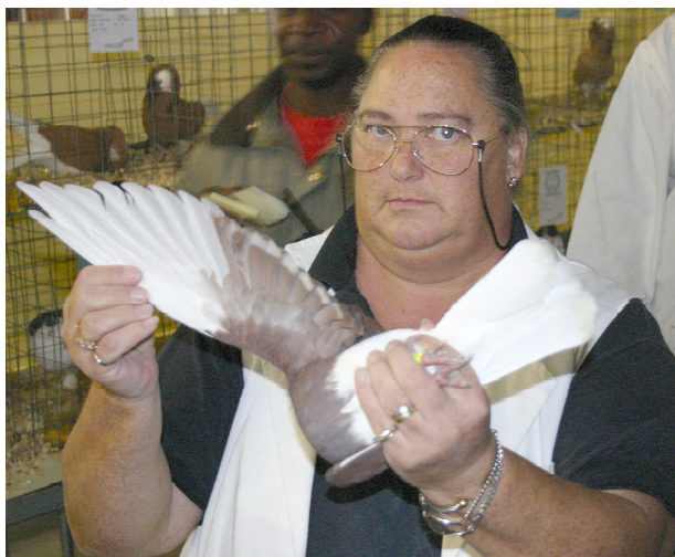
Shows during 2004 that she never showed.

Her favourite breeds were Dutch Capuchines and Ice Pigeons. She also had a flock of Schöneberger Streifige