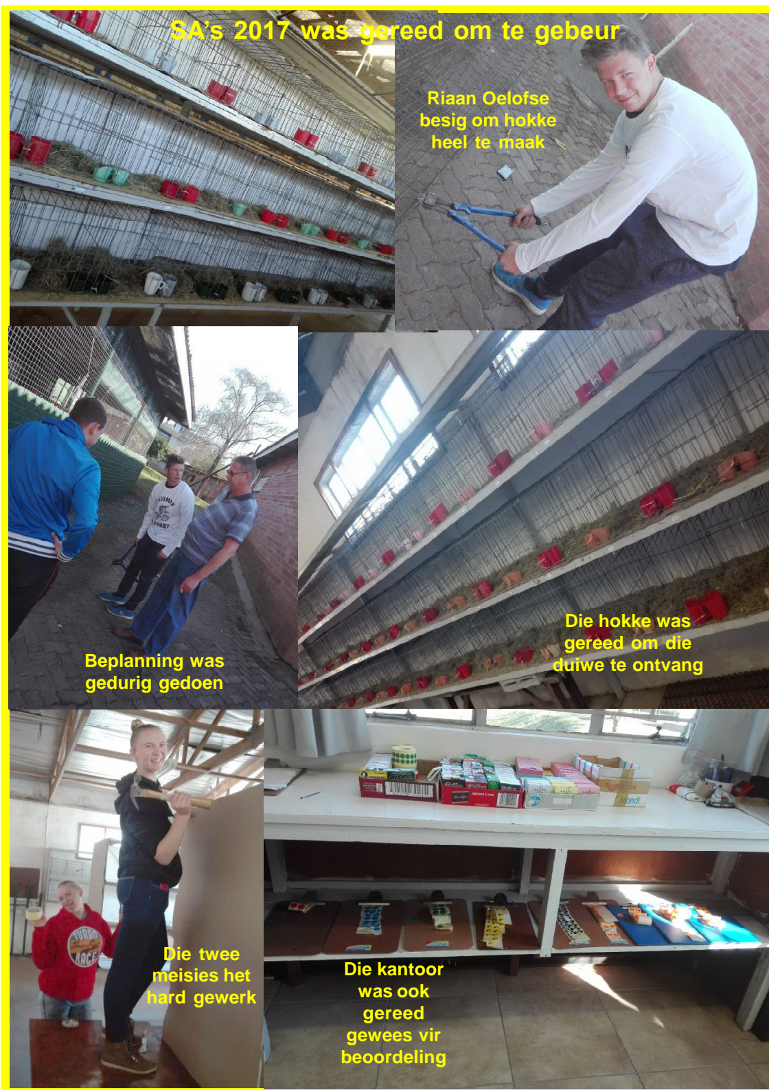
SA's 2017 was gereed om te gebeur