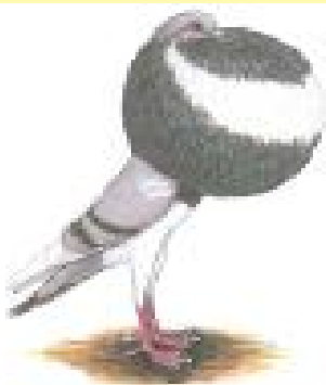
The Fancy Pigeon

E-pos: hennie@bioworx.co.za Webwerf: www.bioworx-pigeon.co.za