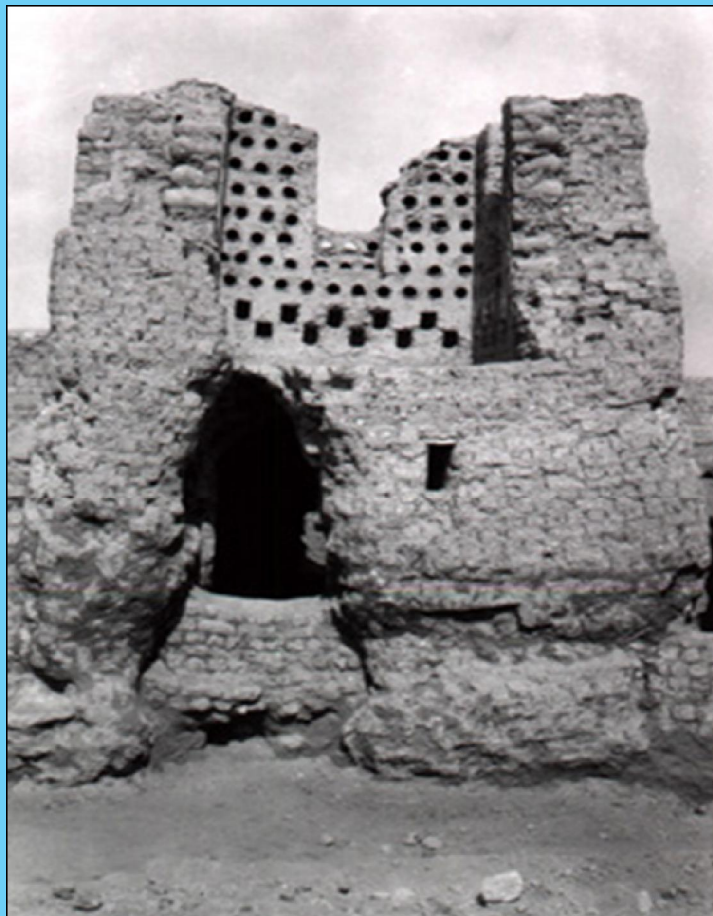
Ancient Egyptian pigeon house 44 AD

in both Great Wars to carry messages, and as a result of their bravery and heroism, tens of thousands of human lives were saved. The last messaging service using pigeons was disbanded in 2006 by the police force in the city of Orrisa, India.