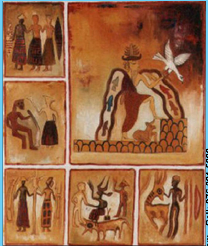
Early wall painting of man with dove

The first mention of the domestication of the rock dove was found in Mesopotamian cuneiform tablets (pictographical writing on clay tablets) dating back over 5000 years. However, it is likely that rock doves were domesticated by Neolithic man as far back as 10,000 years ago in and around the alluvial plains of the Tigris and Euphrates. It was at this time that Neolithic man was starting to cultivate cereal crops and domesticate animals for food. In pre-history it is likely that rock doves lived alongside man in caves and on cliff faces.