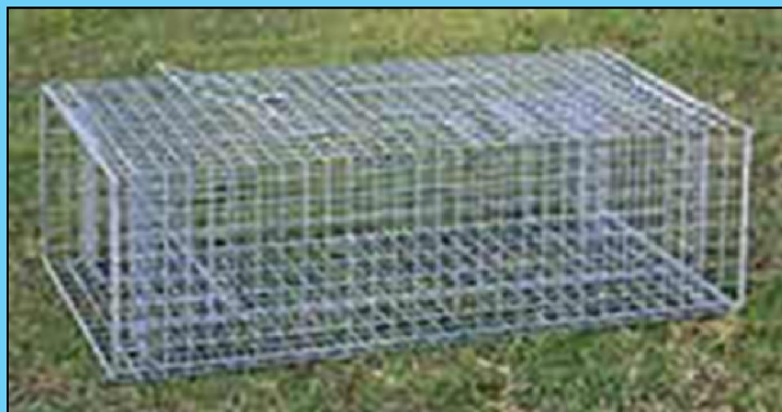
Pigeon Cage Trap

this ancient sport first started, but the early Greeks and Romans are believed to have participated in it. The sport involves each participant using captive pigeons, released from several pigeon lofts or dovecotes at the same time, and to lure as many birds as possible away from adjoining lofts using specially trained pigeons. The captured birds were either killed or held for ransom. This sport has continued through the centuries and is still played today. In the Turkish city of Urfa the sport involves over 500 flocks in a single event.