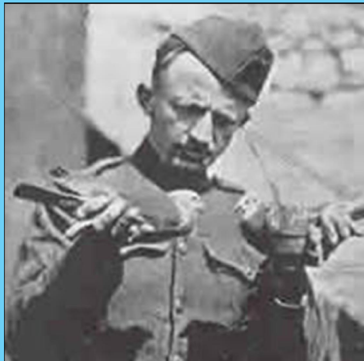
Carrier Pigeons - WW1

The pigeon is probably best known for its ability to return 'home' from long distances and has been used extensively by man for this purpose. The earliest reference to the pigeon being used to carry messages dates back to 2500 BC and the tradition has continued throughout history. The Romans and ancient Greeks used the pigeon extensively for carrying messages and the first sophisticated messaging service was established in Syria and Persia in the 12th century AD, with messages being carried by pigeons from city to city.