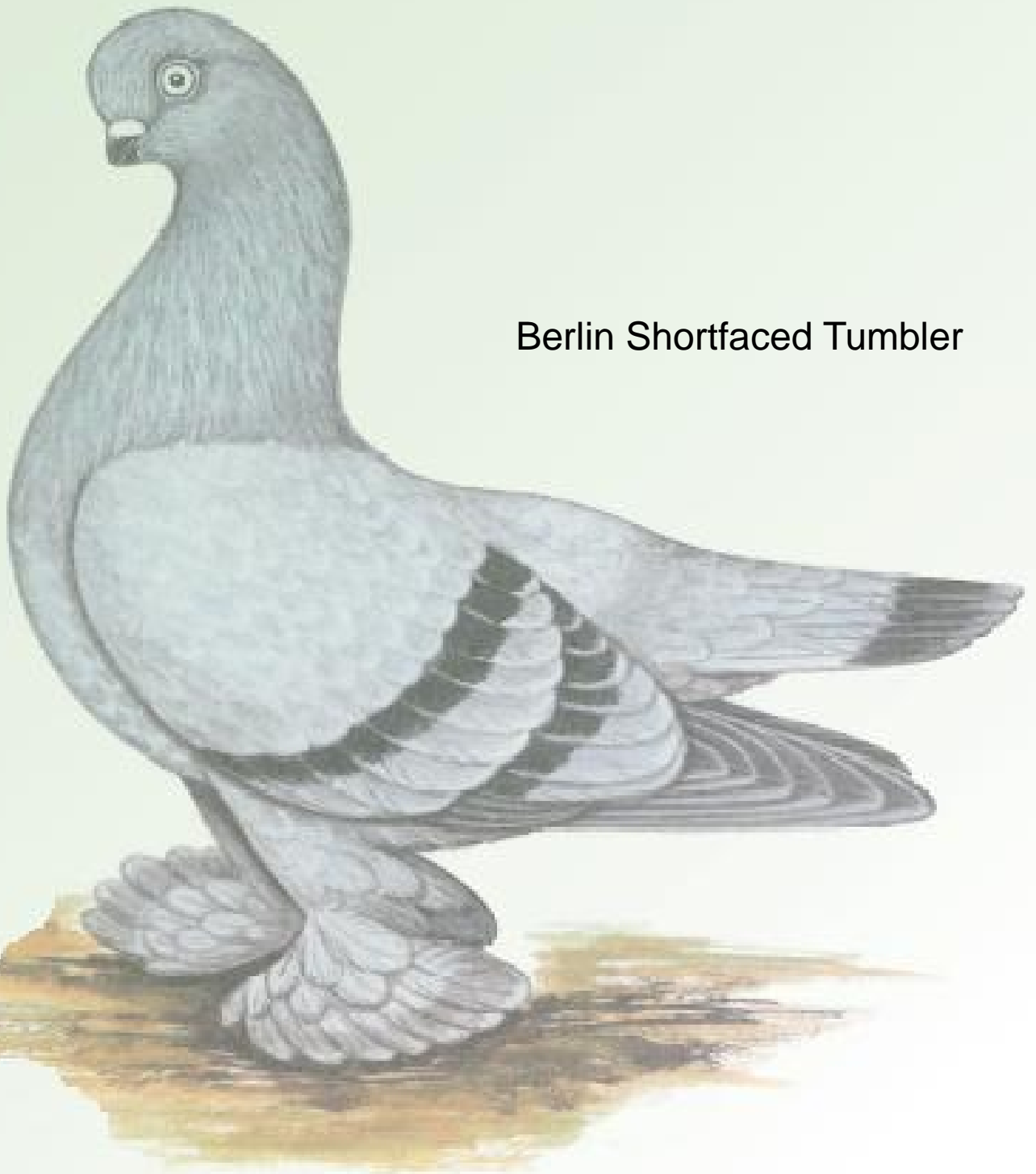
Berlin Shortfaced Tumbler

For the love and care of Fancy Pigeons / Vir die liefde en versorging van Sierduif