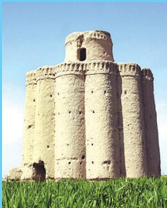
Ancient Persian Dovecote

Since its domestication many thousands of years ago, the pigeon has been revered by many religions, including Hindu, Islam, Christian and Sikh. Although Neolithic man (circa 8500 BC onwards) undoubtedly domesticated the rock dove, there is little indication that the bird was used for anything but food.