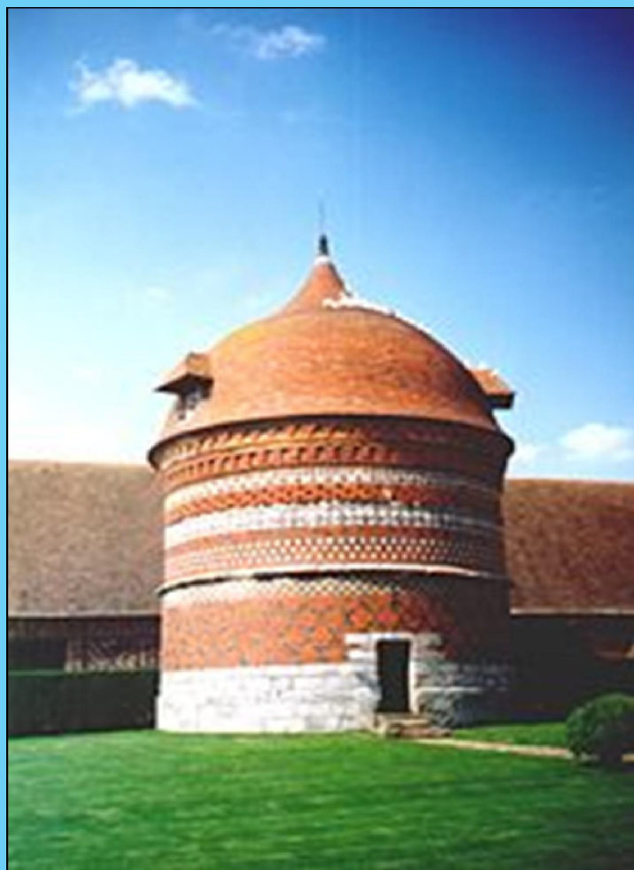
Dovecote, Dieppe, France

thousands of birds in the 17th, 18th and 19th centuries.