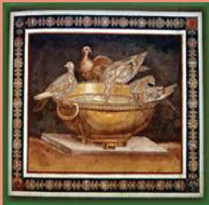
Roman Mosaic 3rd Century AD

also bred different varieties and used the pigeon widely as a messenger. Historian and philosopher Caius Pliny, writing in the 1st century AD, says: "Many people have quite a mania for pigeons, building turrets for them on house roofs and trac