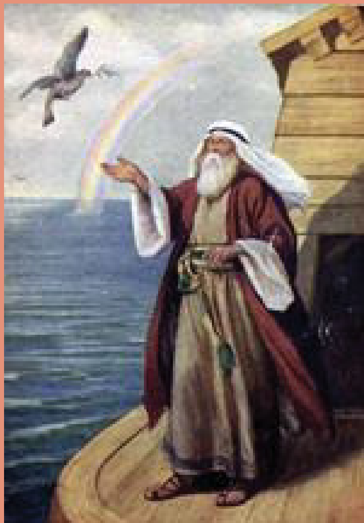
Noah and Dove of Peace

worship. The pigeon was used as a sacrifice in early history, with King Rameses III, King of Egypt, sacrificing 57,000 pigeons to the god Ammon at Thebes in 1100 BC.