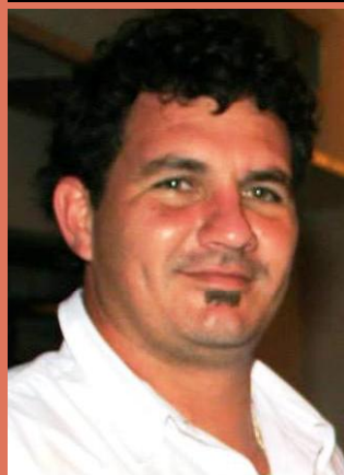
2022 Royal Agricultural Show – Pietermaritzburg